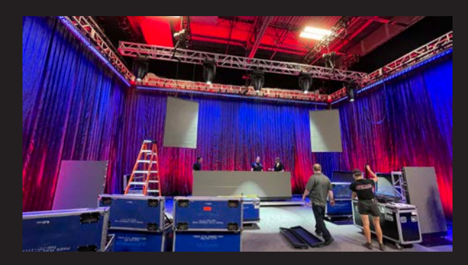
▲ We produced a hybrid event in Sandy, UT that included five LED walls, lighting, audio, 4k cameras, switching, recording, and web streaming. We provided a rigging and drape solution to create a custom filming environment inside a warehouse.