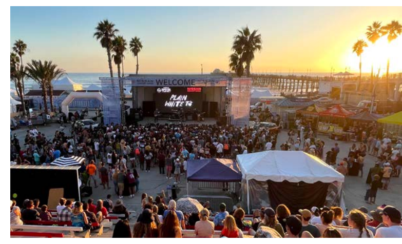
Power Plus supported Netflix with lights and sound while filming singer Sofia Carson for the upcoming movie, Purple Hearts.

Power Plus set up at the beach for the 14th Annual Nissan Super Girl Surf Pro , the World's Largest Women's Surf Event and Music Festival. The 3-day event featured 20 live concerts. Power Plus was responsible for the main stage including rigging, sound, lighting, and LED video wall. We also provided a secondary video wall for the Esports tent, along with audio for the main surfing competition. ▼